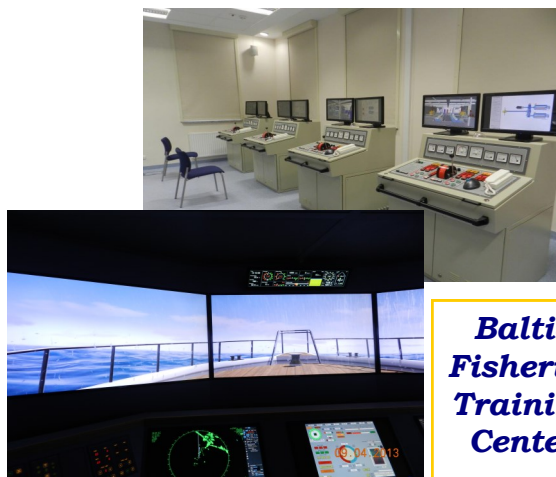
Baltic Fisheries Training Center

Except the high performed thematic sessions the organizers will provide many entertainments in the good company of scientists.