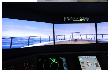
Baltic Fisheries Training Center