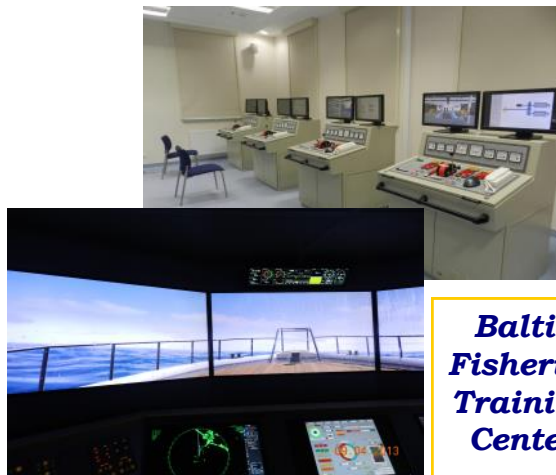
Baltic Fisheries Training Center

Except the high performed thematic sessions the organizers will provide many entertainments in the good company of scientists.